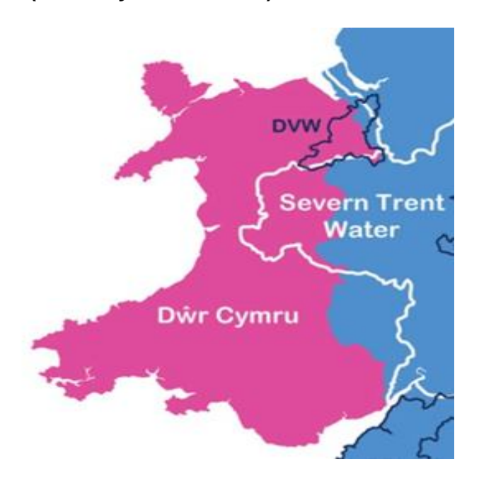
Map 2: The Appointment Areas of the cross border Water and Sewerage Undertakers in Wales (courtesy of Water UK)